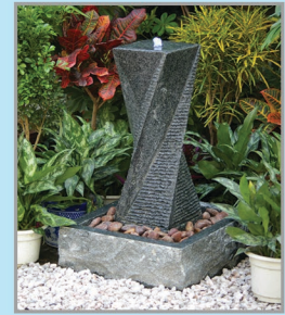
Fountain/Lantern Rendering & Inspiration Imagery