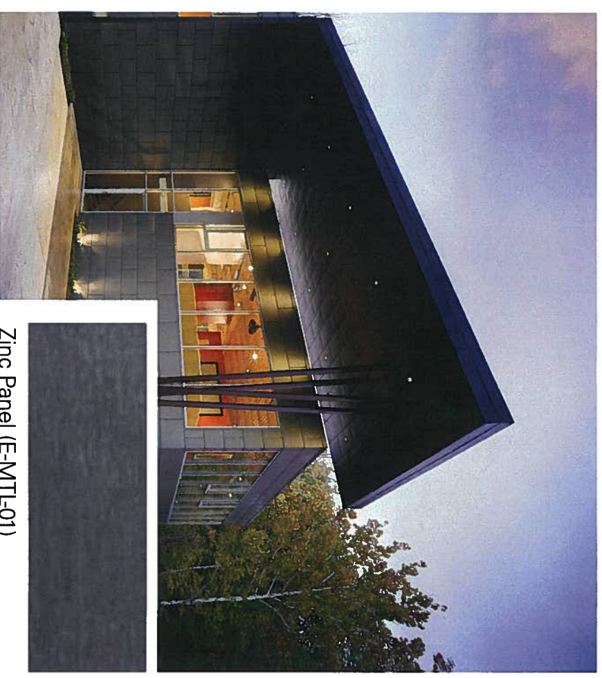
Zinc Panel (E-MTL01)