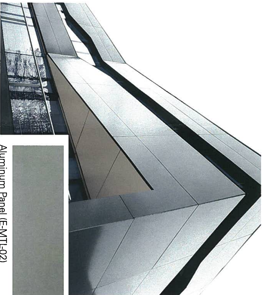
Aluminum Panel (E-MTL02)