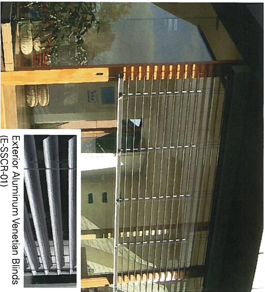
Exterior Aluminum Venetian Blinds (E-SSCR-01)