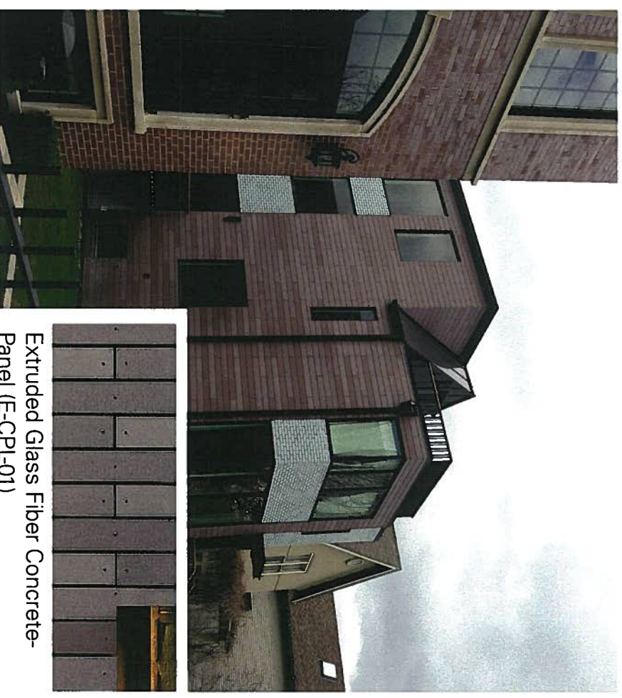
Extruded Glass Fiber Concrete- Panel (E-CPL01)