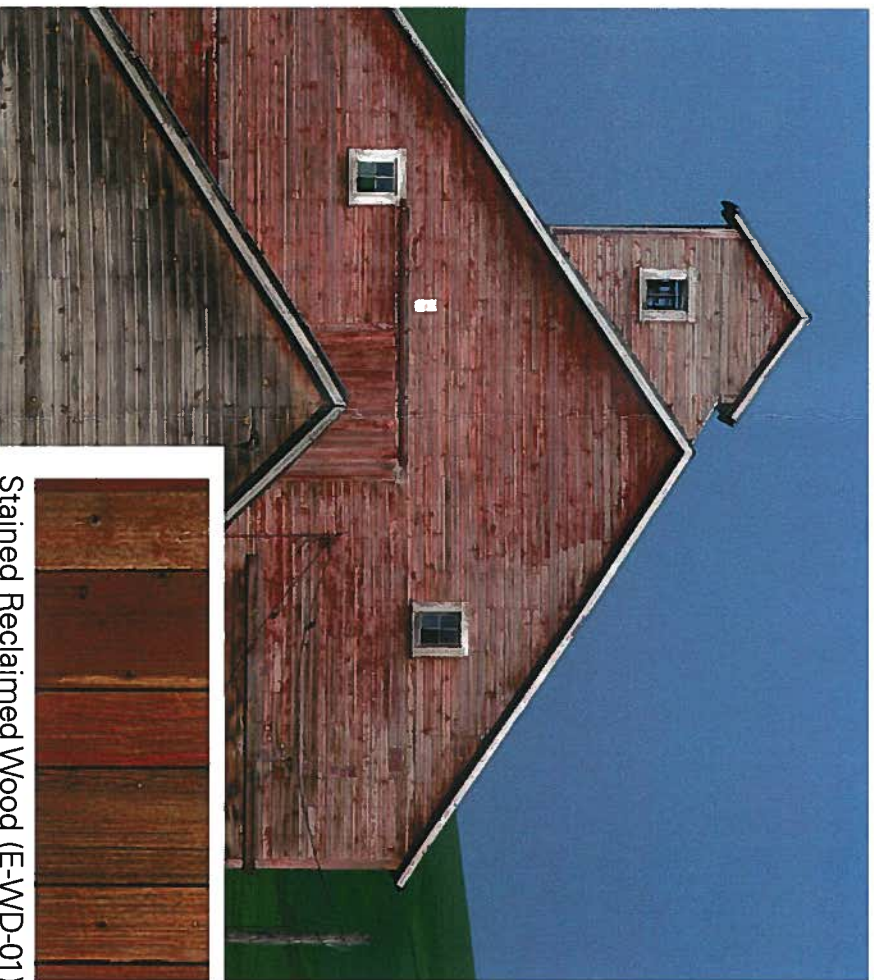
Stained Reclaimed Wood (E-WD-01)