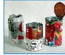
Aluminum & Steel cans