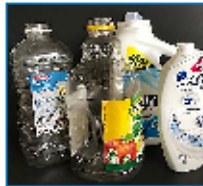
Plastic Kitchen, Laundry, Bath: Bottles & Containers