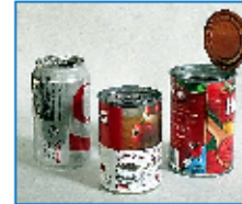
Aluminum & Steel cans