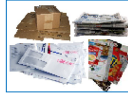
Cereal Boxes, Newspaper, Magazine, Mail, Cardboard & Paper Tubes

Dear Oberlin Residents and Recycling Customers,