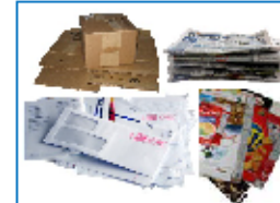
Cereal Boxes, Newspaper, Magazine, Mail, Cardboard & Paper Tubes

Dear Oberlin Residents and Recycling Customers,