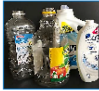
Plastic Kitchen, Laundry, Bath: Bottles & Containers